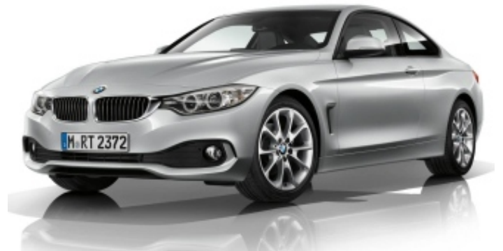
*Picture provided is a sample only