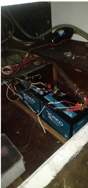
Batteries need strapping down