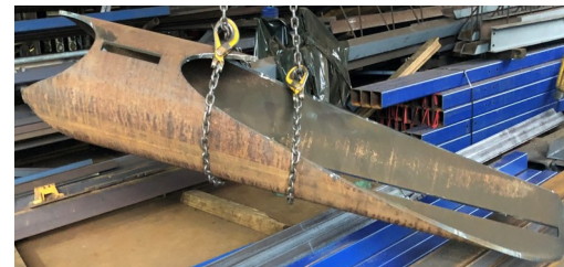
COMPLEX PIPE PROCESSING