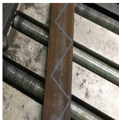
ETCH MARKING (CLEATS & LABELS)