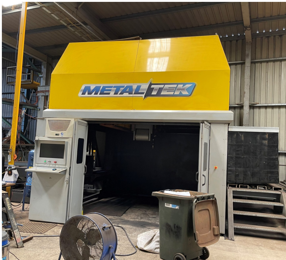
ROBOT CABINET AND CONTROL PANEL