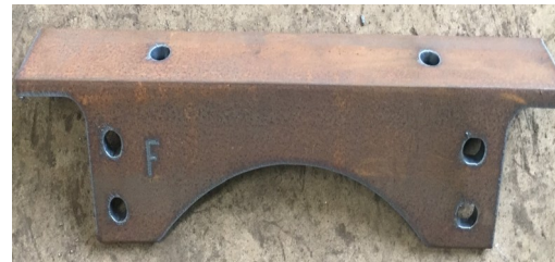
ANGLE PROCESSING (Round an slotted holes)